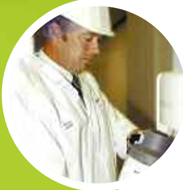
▲ Micro swabs are used to check cleaning results